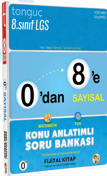
0'dan 8'e Sayısal Konu Anlatımlı Soru Bankası