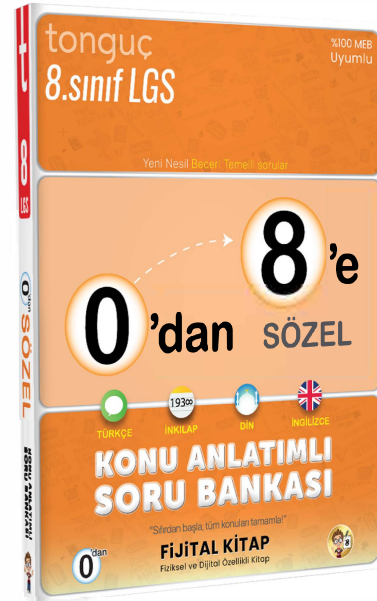
0'dan 8'e Sözel Konu Anlatımlı Soru Bankası