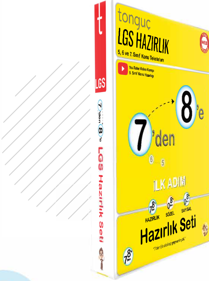
7'den 8'e İlk Adım Hazırlık Seti